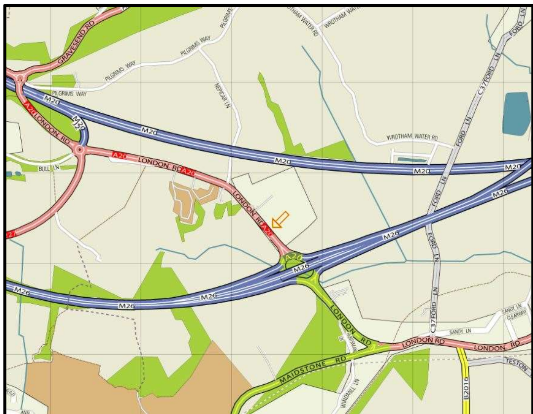
Figure 2: Highway Context Plan