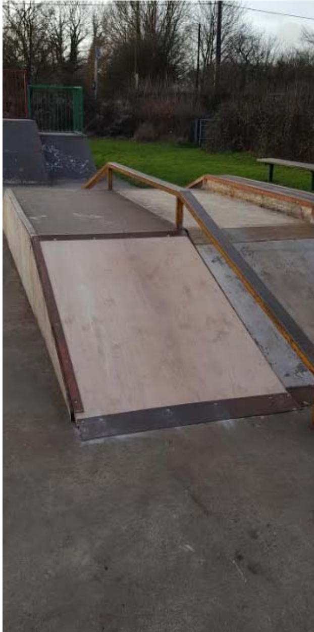
Panel replaced, will be faced in metal at a later stage