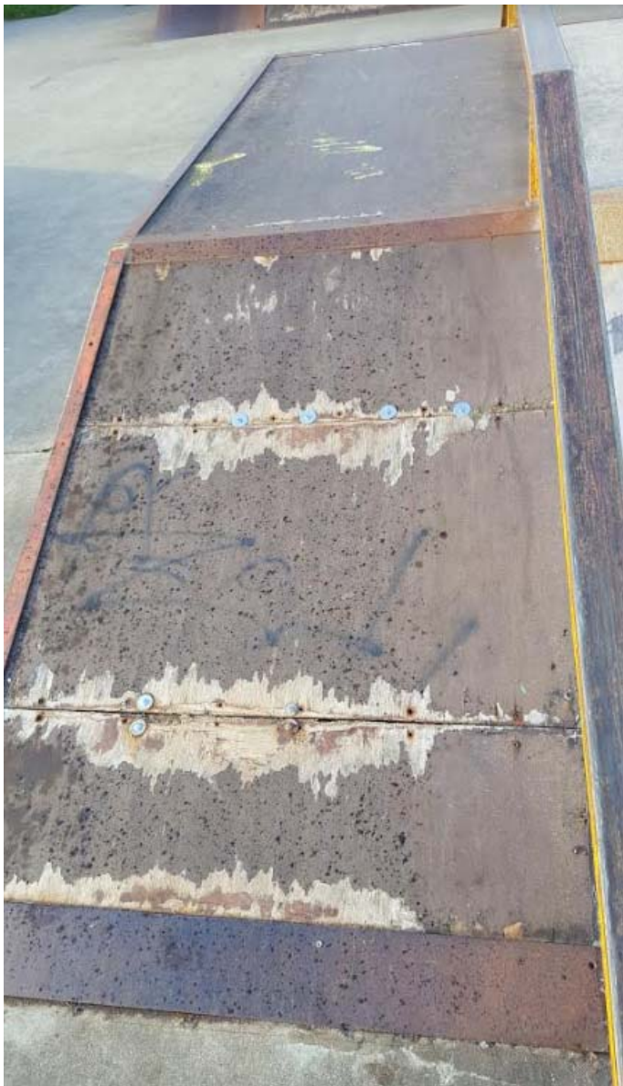
Worn surface full of repairs