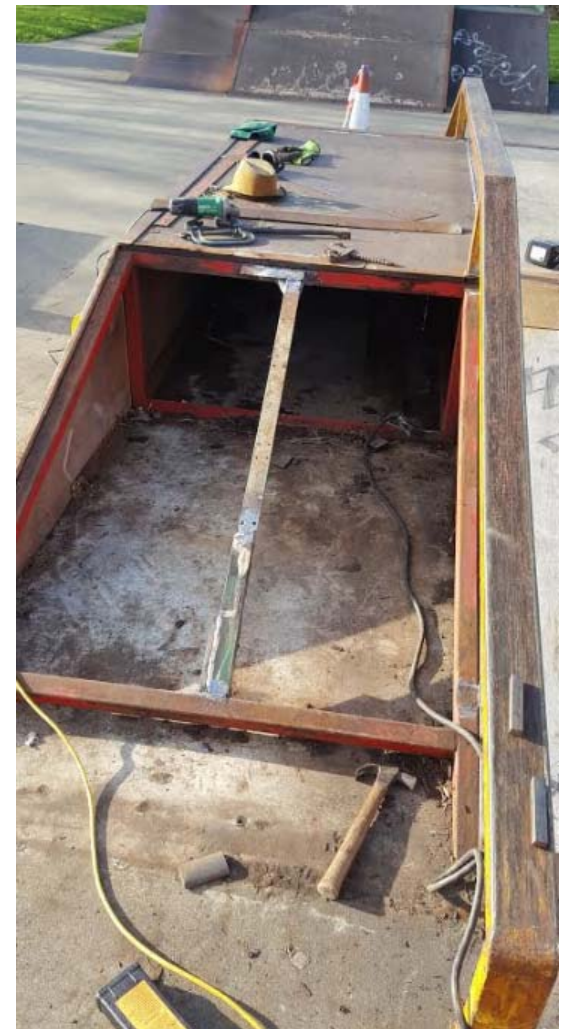
Bin now additional panel support