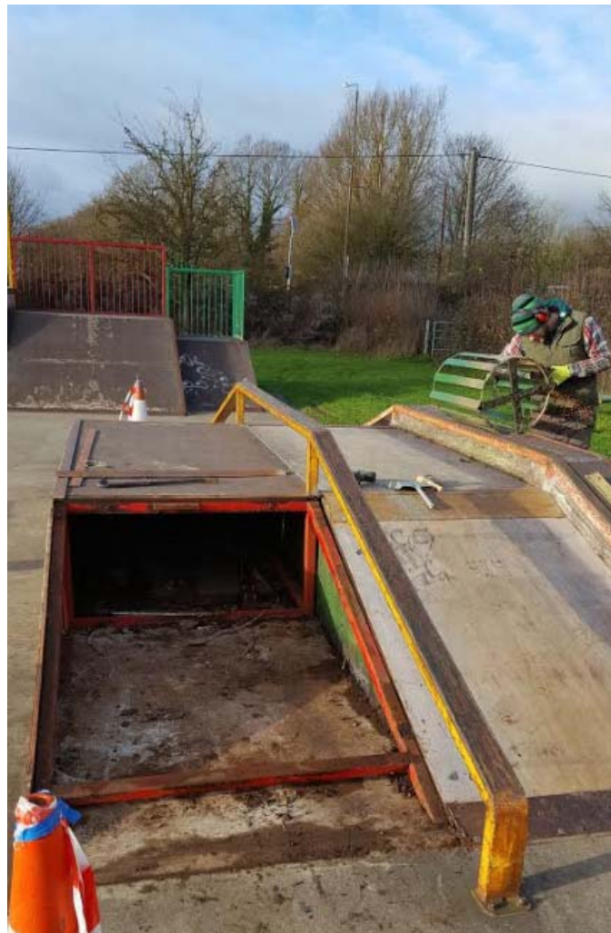
Recycling a redundant bin